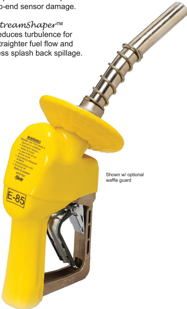
Shown w/ optional waffle guard