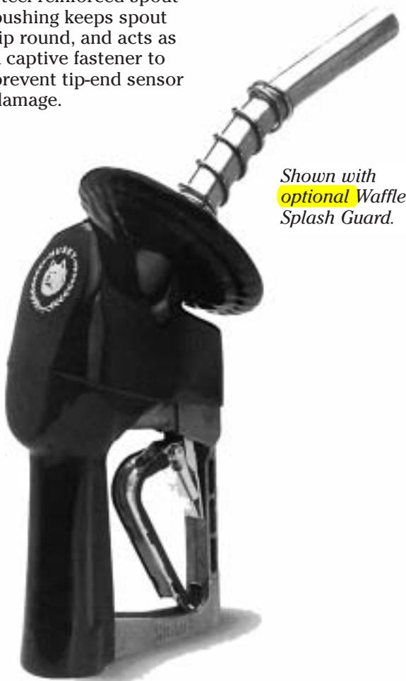
Shown with optional Waffle Splash Guard.